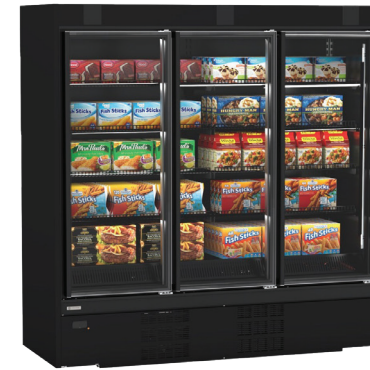
Optional black interior finish