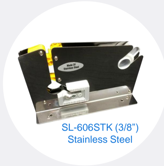
SL-606STK (3/8") Stainless Steel