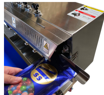
Adjustable Bag Entry Guide