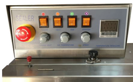
Easy to Use Control Panel