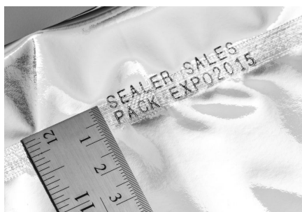
Dry Ink Coding Print at Seal Line