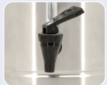
Non-Drip Water Faucet