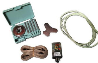
Included Manufacturers' Kit