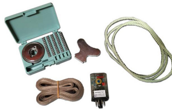
Included Manufacturers' Kit