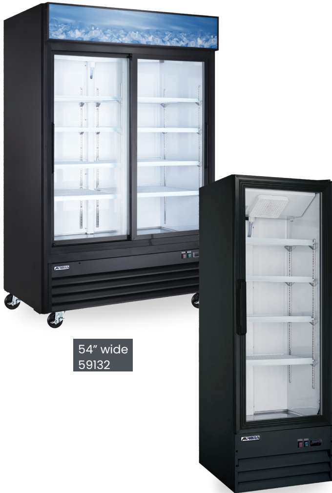
54" wide 59132

ITEM: 59132 59133 MODEL: RE-CN-0045EB-HC RE-CN-0009EB-HC