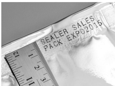
Dry Ink Coding Print at Seal Line