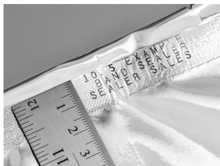
Optional: Smaller 10.5PT Typesets