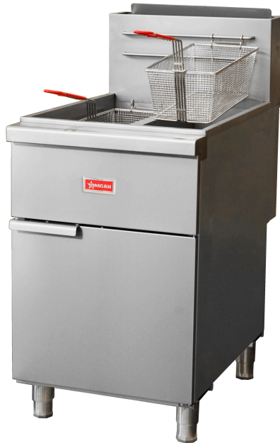
NG: 48308 LP: 48639

Available in Natural Gas and Liquid Propane.