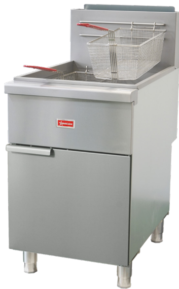
NG: 48307 LP: 48638