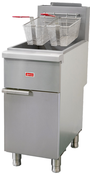
NG: 48305 / 48306 LP: 48636 / 48637